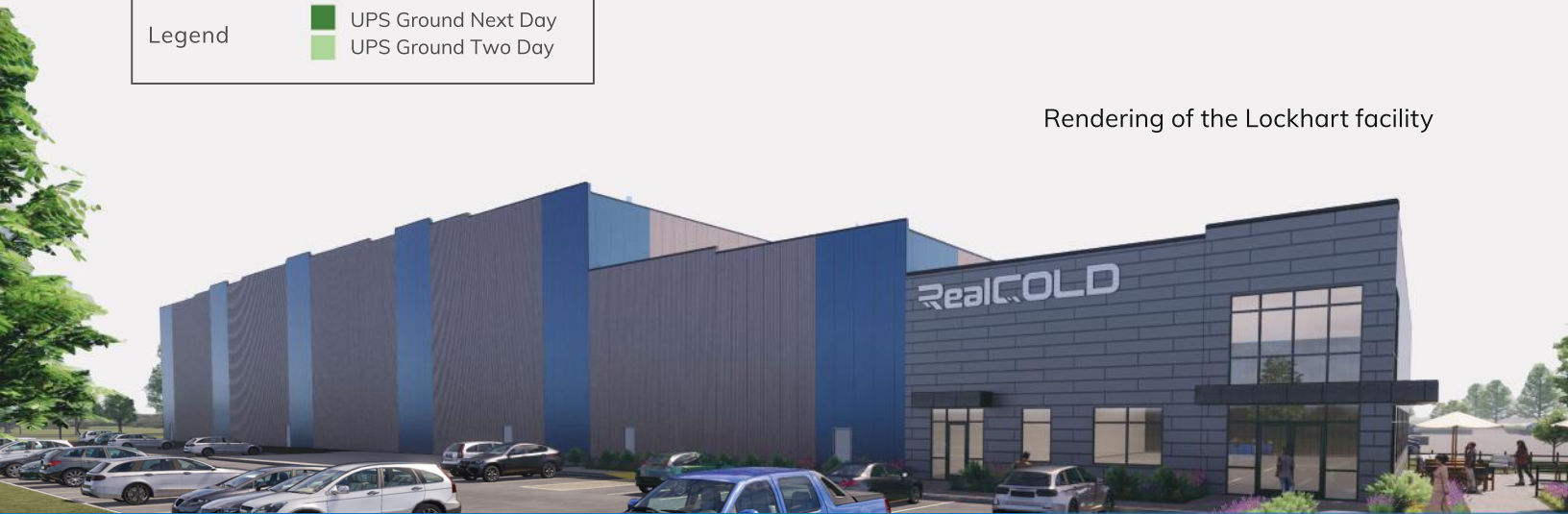
Rendering of the Lockhart facility