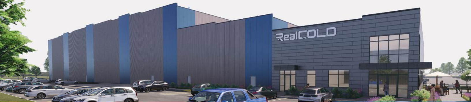
Rendering of the Lockhart facility